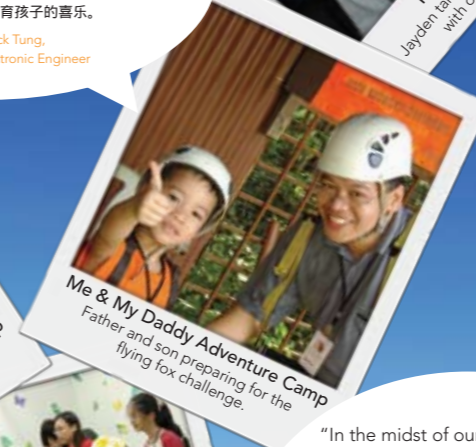
Me & My Daddy Adventure Camp Father and son preparing for the flying fox challenge.