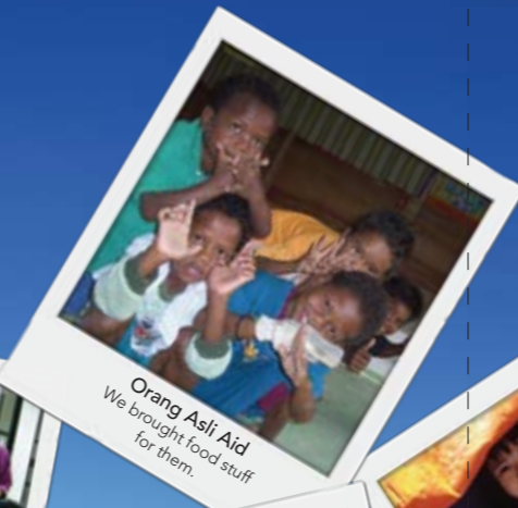
Orang Asli Aid We brought food stuff for them.