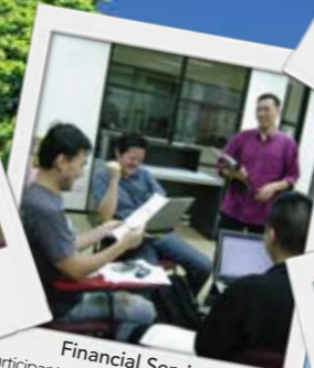
Financial Seminar Participants gathered for a financial tutorial session before the seminar even begins.