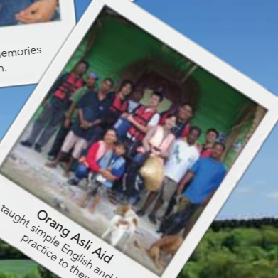
Orang Asli Aid We taught simple English and hygiene practice to them.